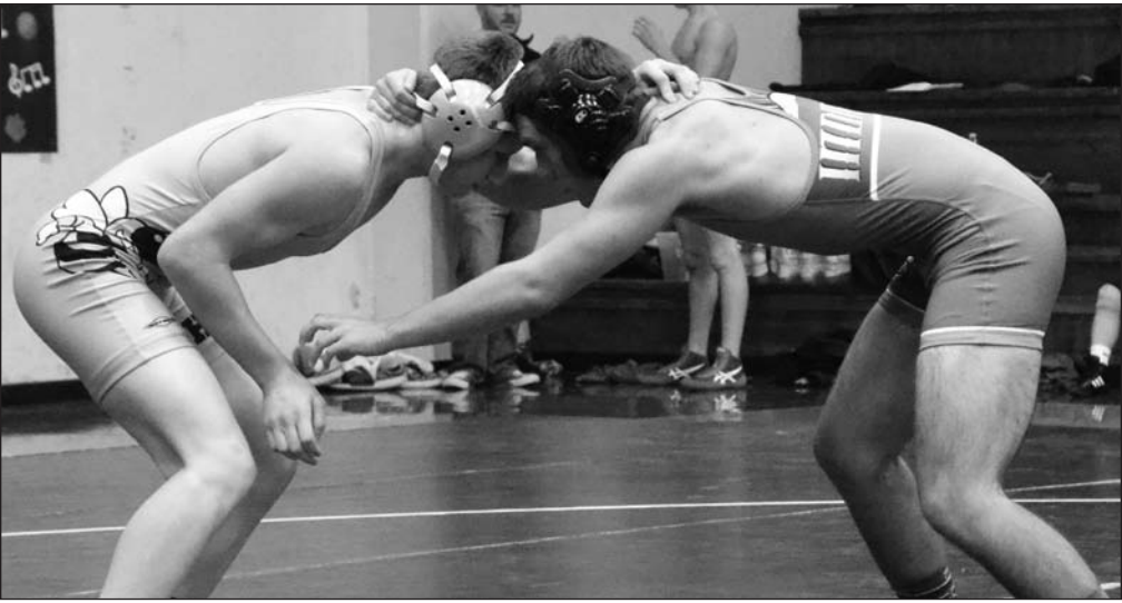
Towns County basketball