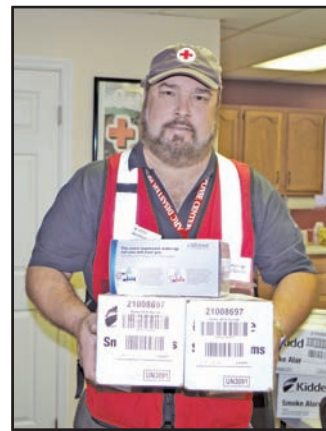
Red Cross volunteer with smoke alarms

Assisting the Red Cross were several Hiawassee vol-